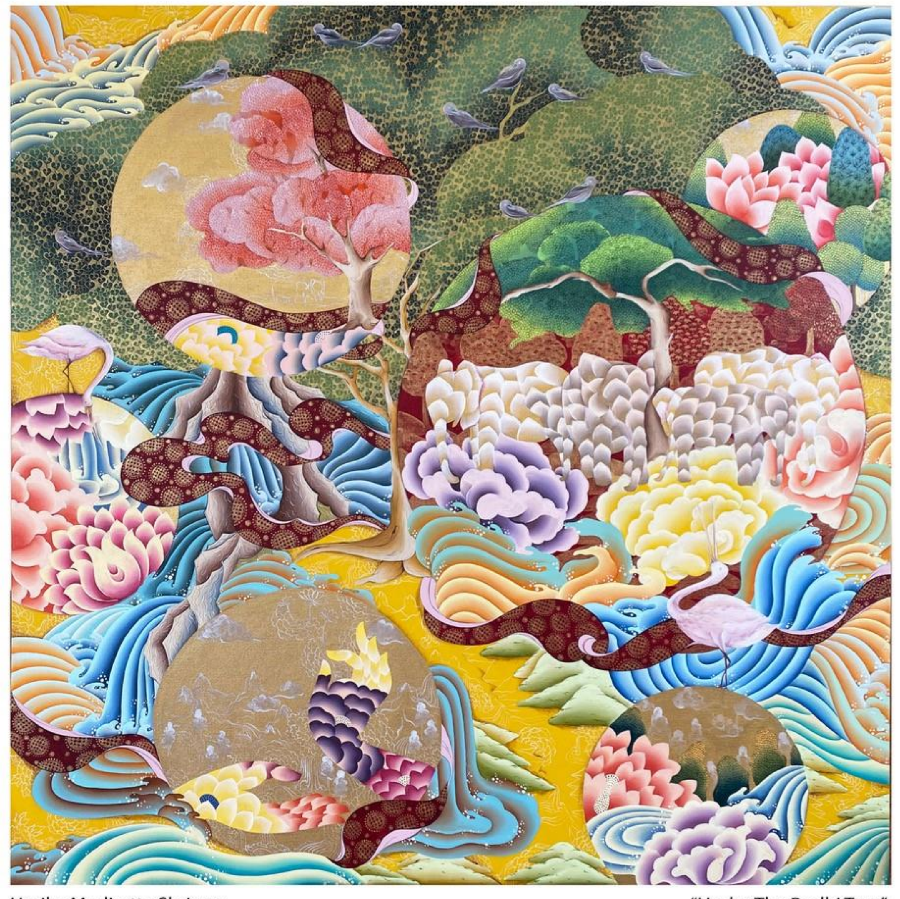
Umika Mediratta Shriram 2022