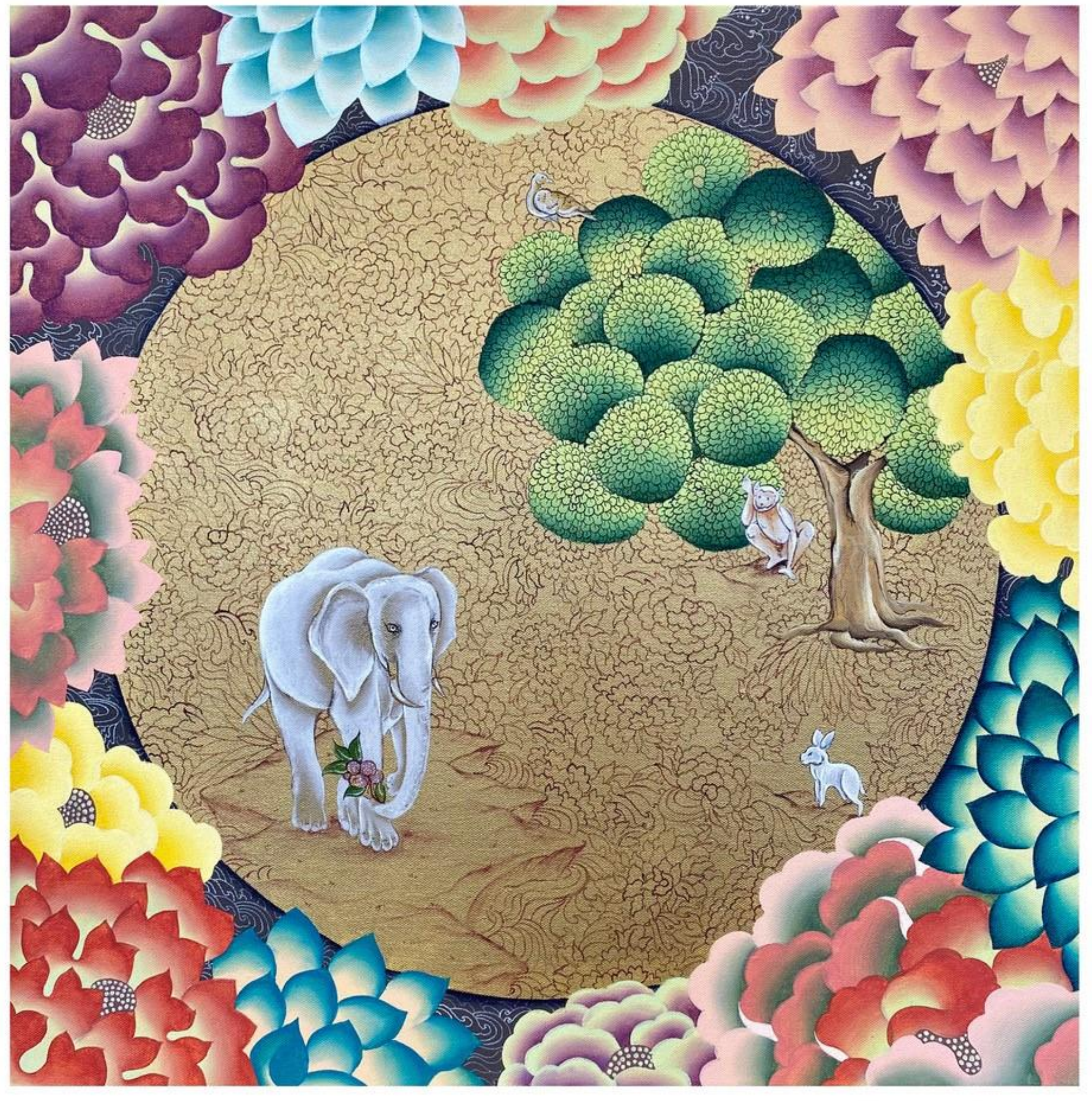
Umika Mediratta Shriram 2023