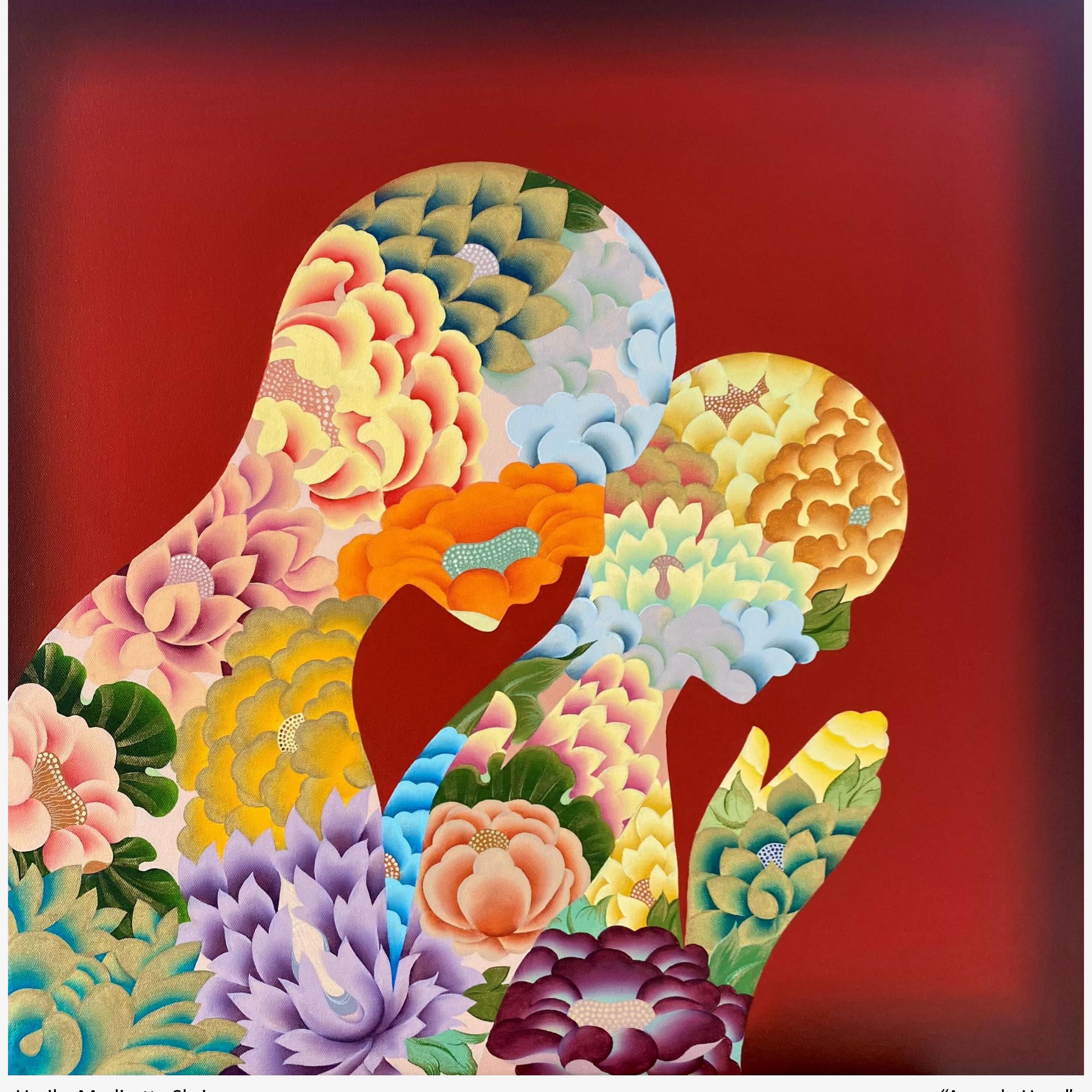
Umika Mediratta Shriram 2023