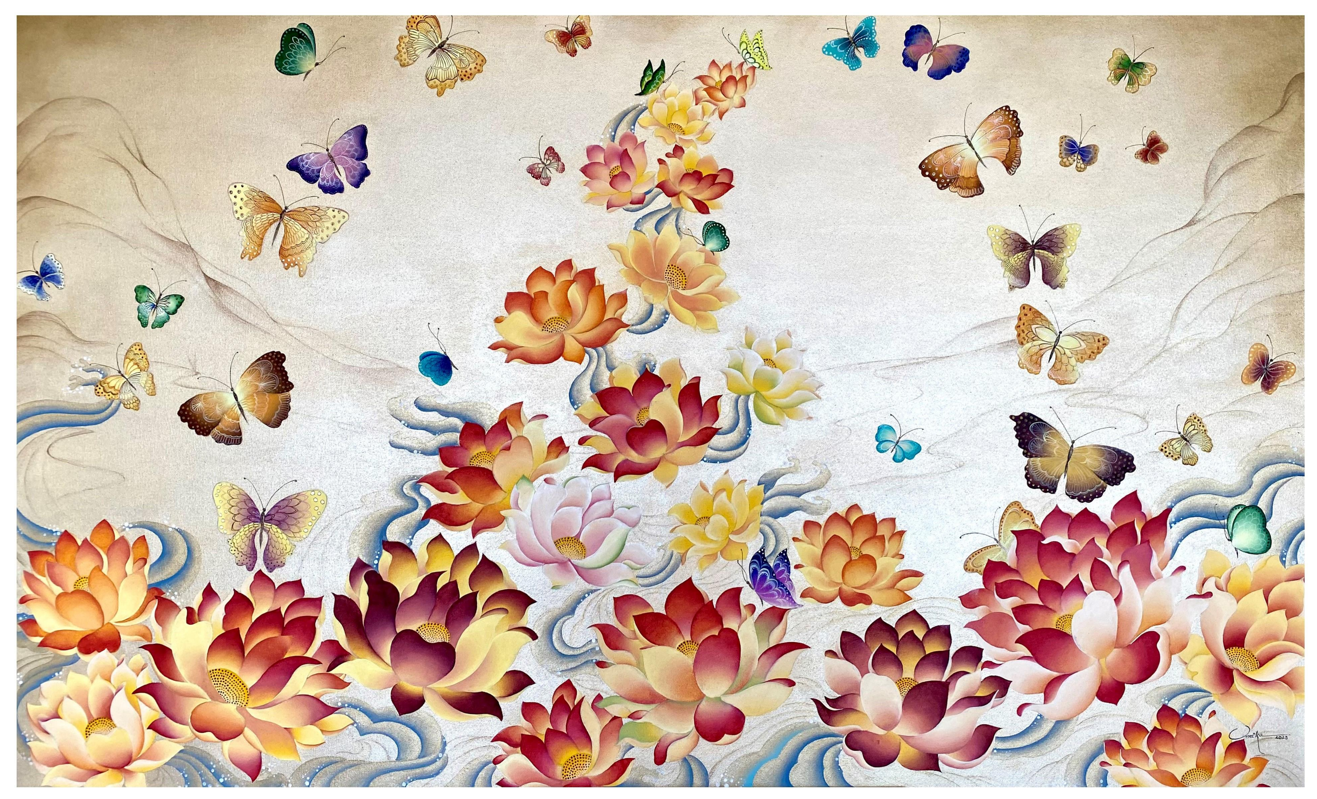
Umika Mediratta Shriram 2023