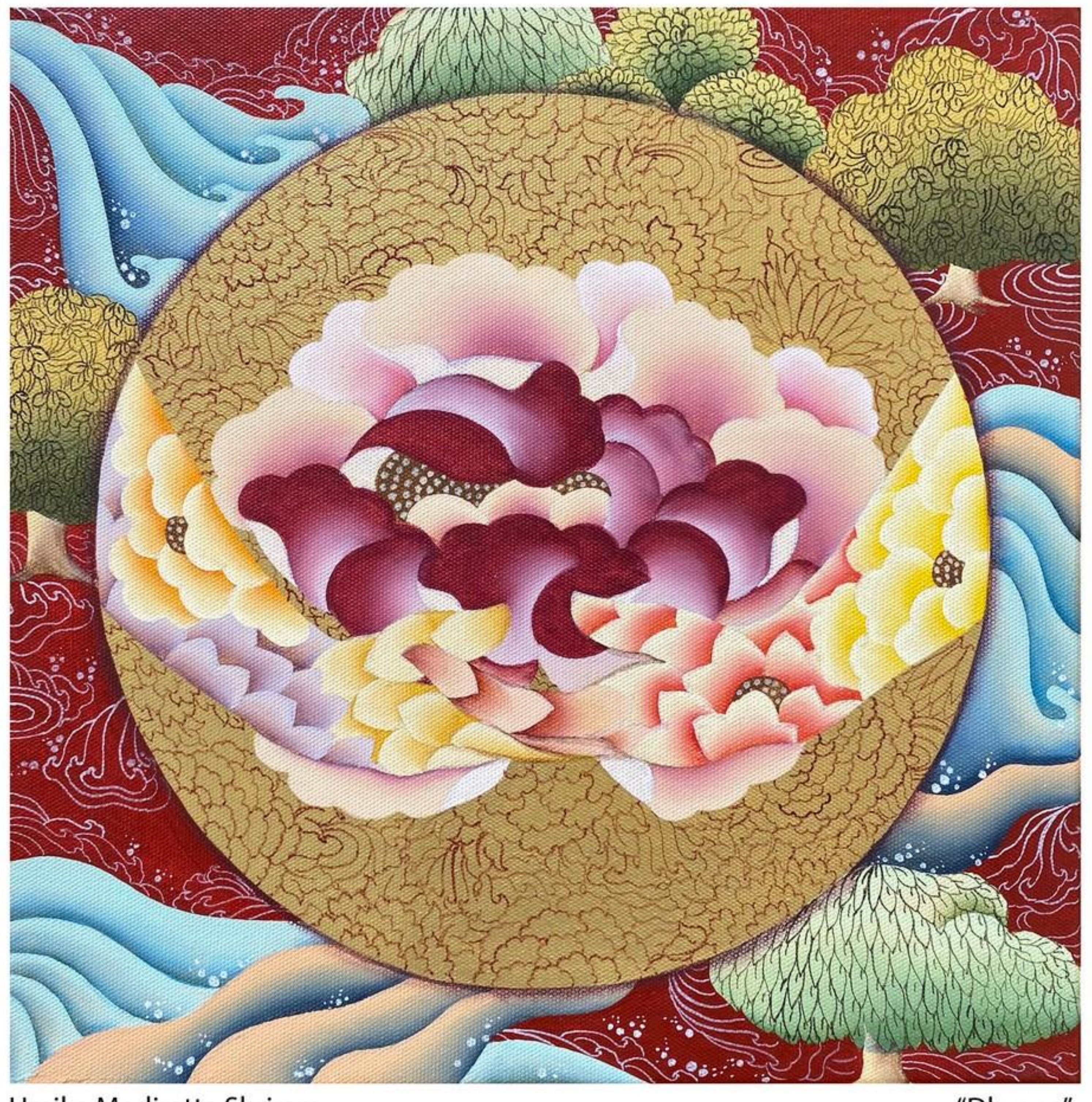
Umika Mediratta Shriram 2023