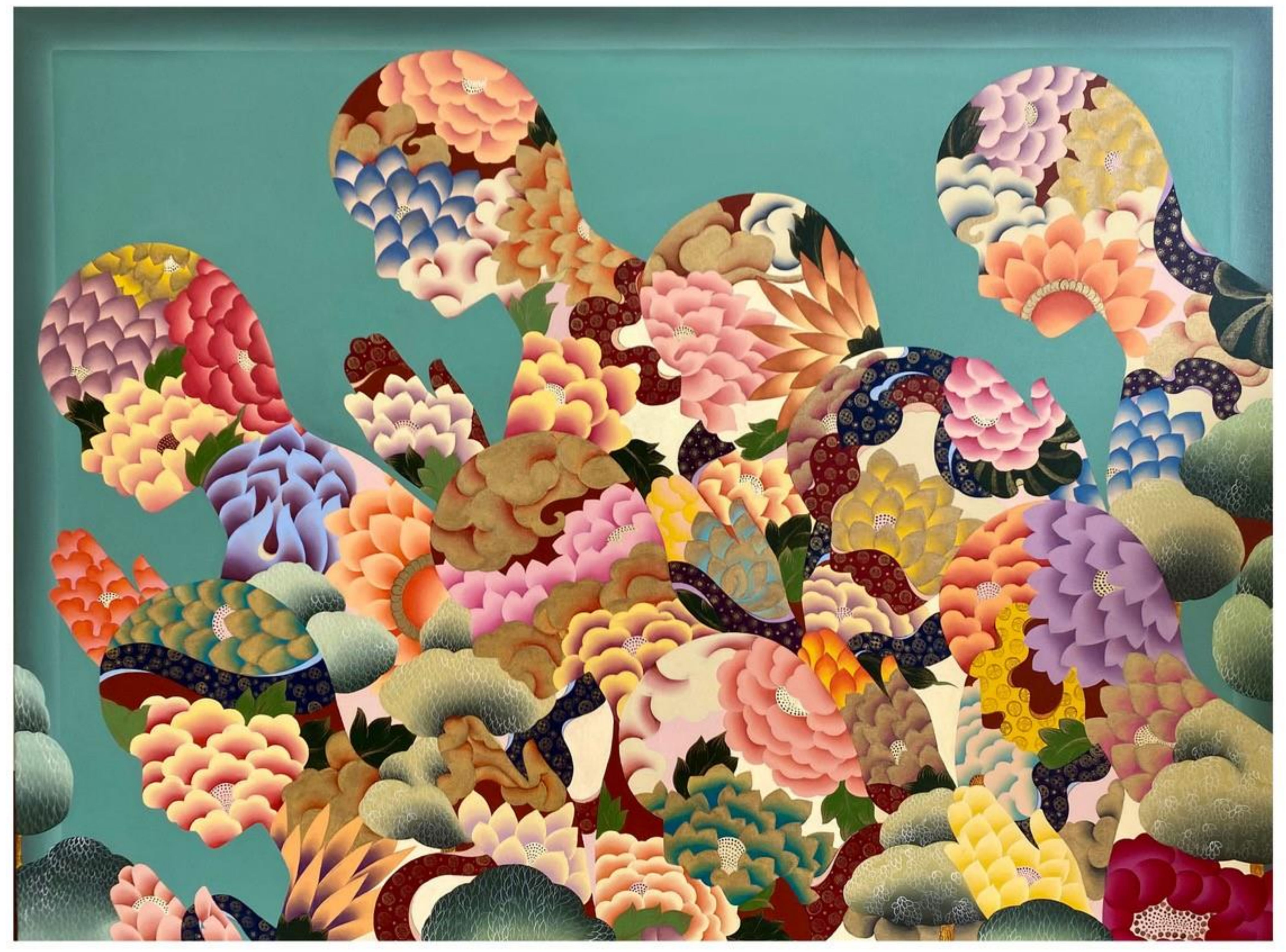
Umika Mediratta Shriram 2023