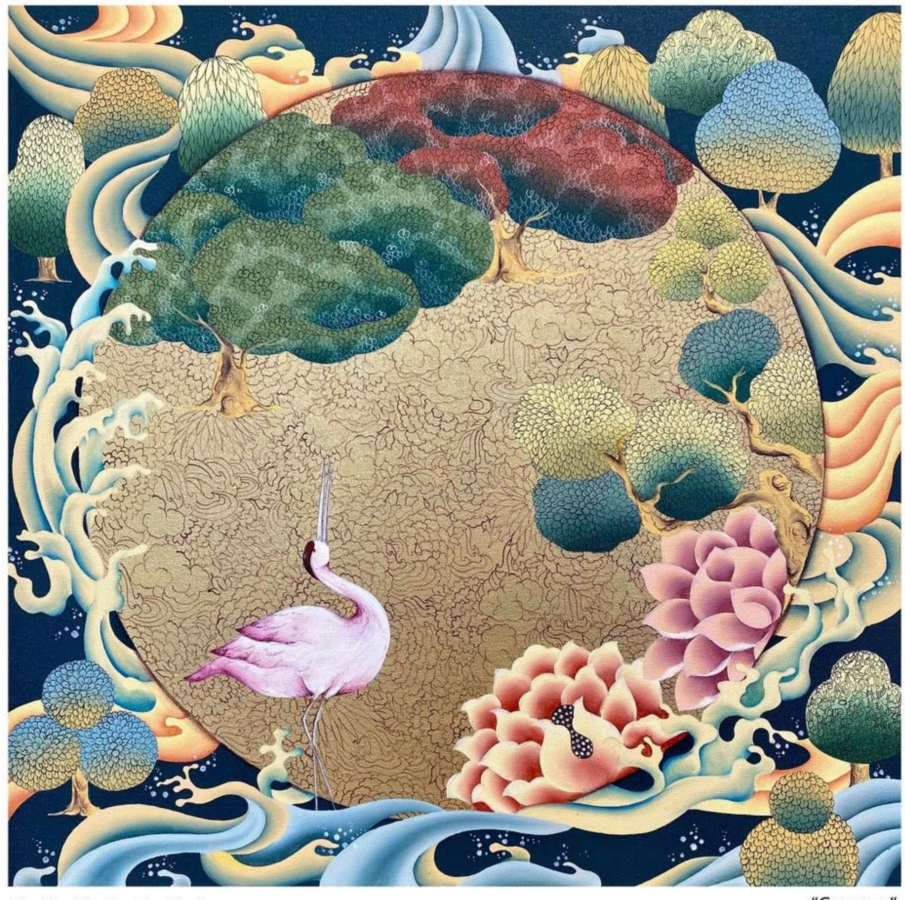
Umika Mediratta Shriram 2023