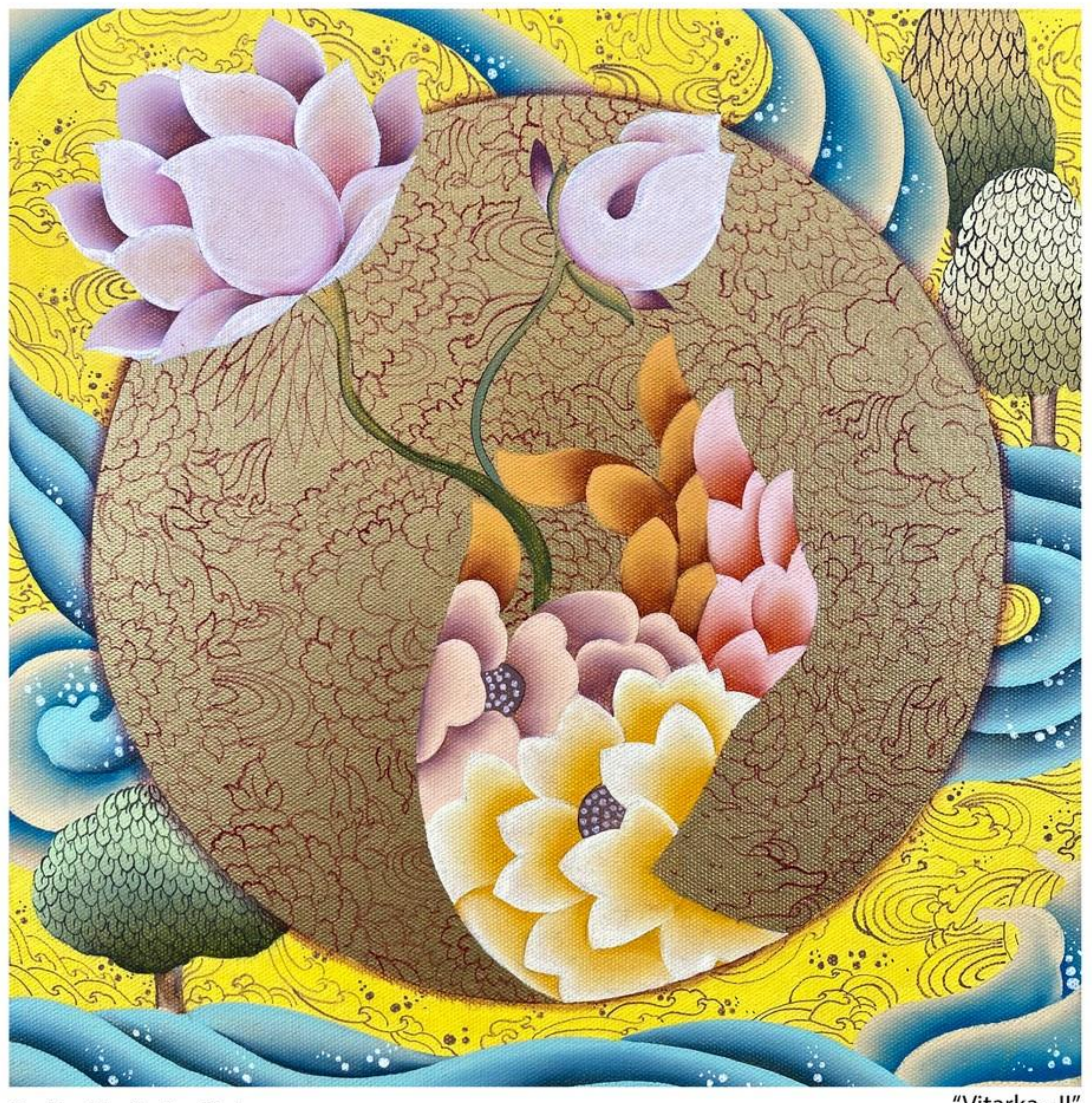
Umika Mediratta Shriram 2023