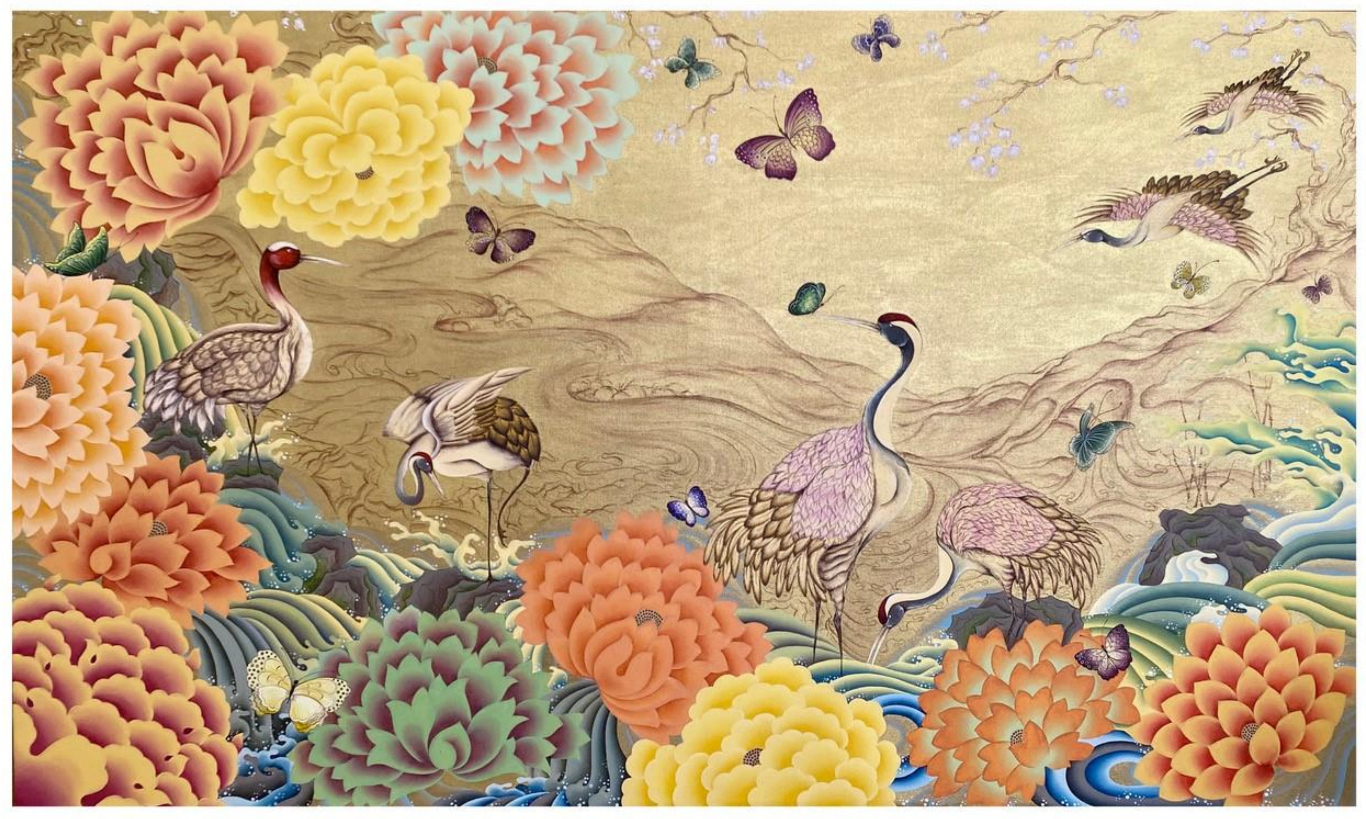
Umika Mediratta Shriram 2023