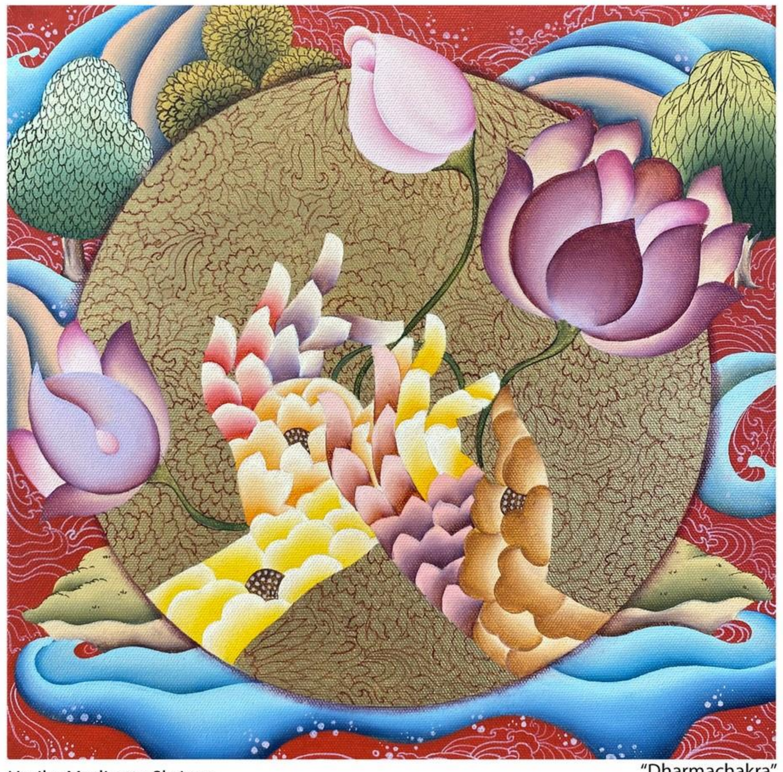
Umika Mediratta Shriram 2023