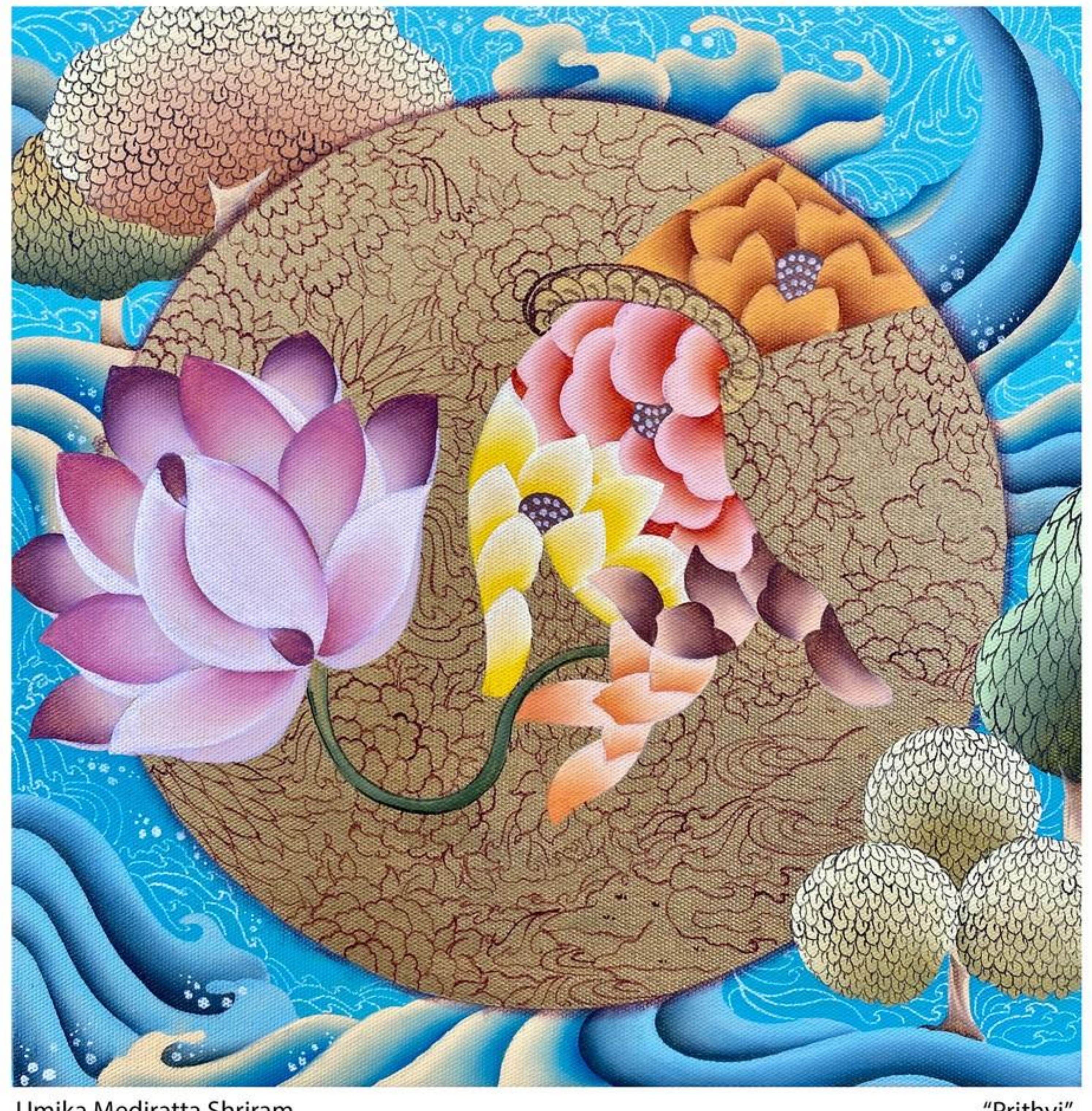
Umika Mediratta Shriram 2023