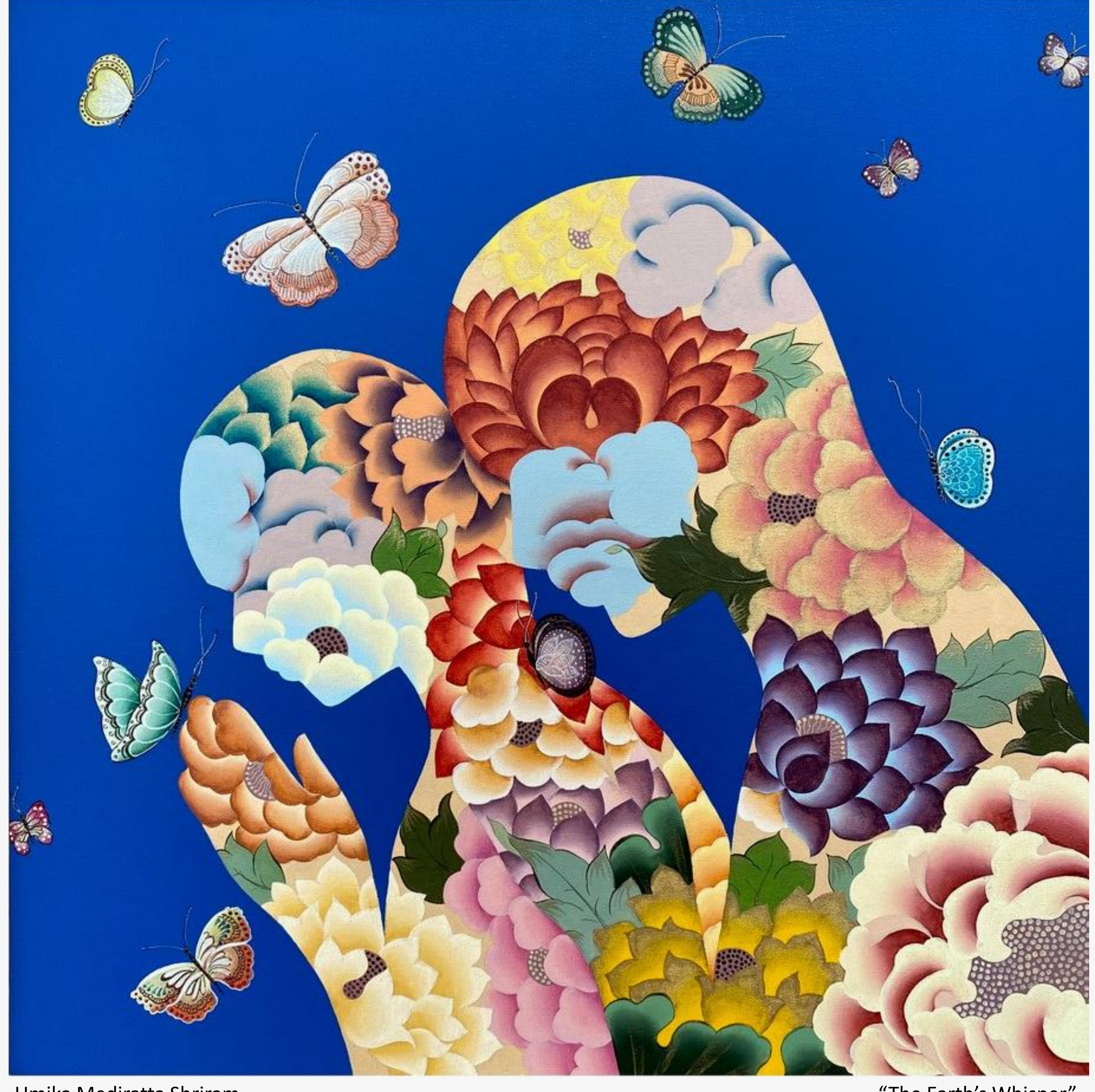
Umika Mediratta Shriram 2023