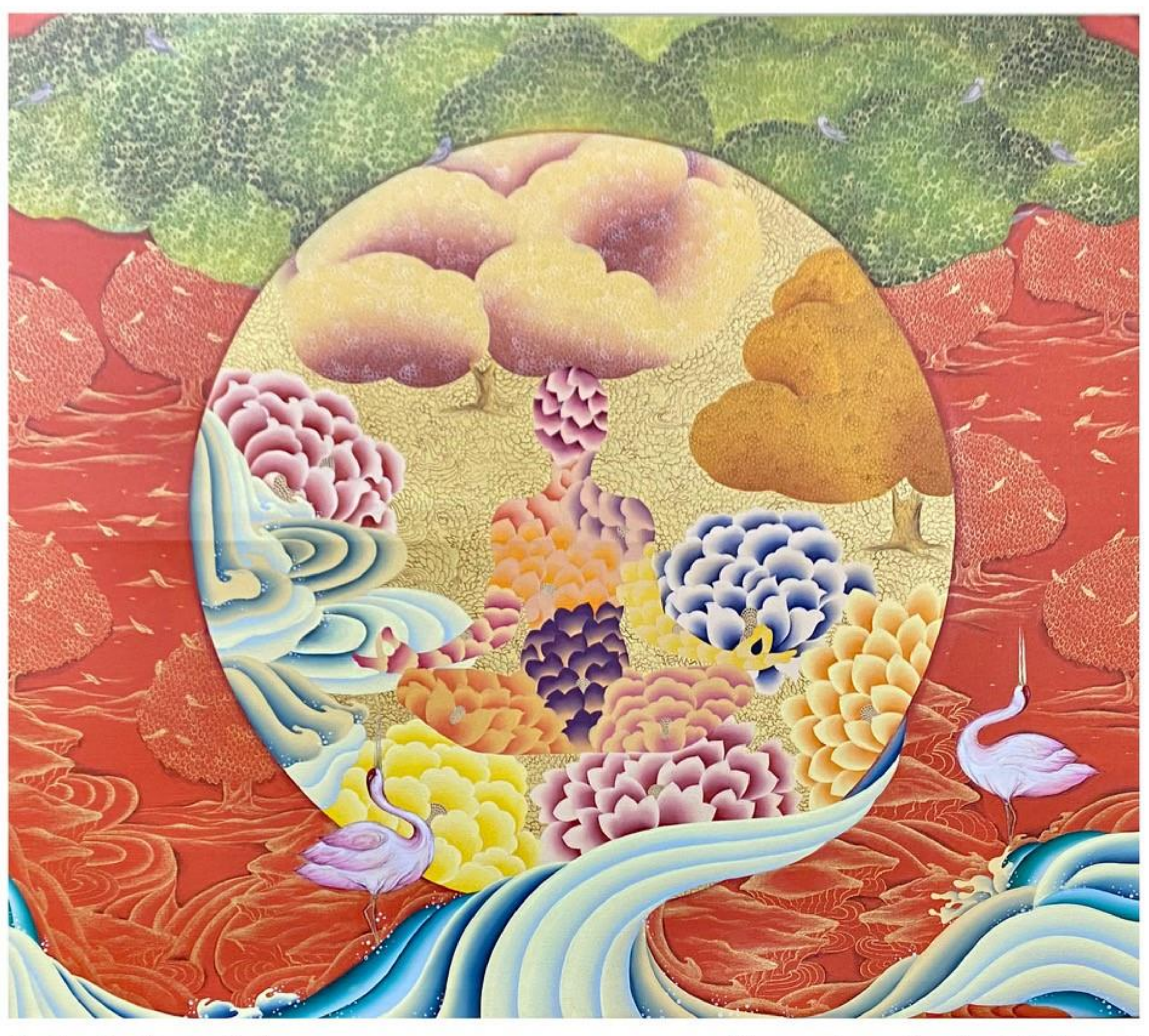
Umika Mediratta Shriram 2023