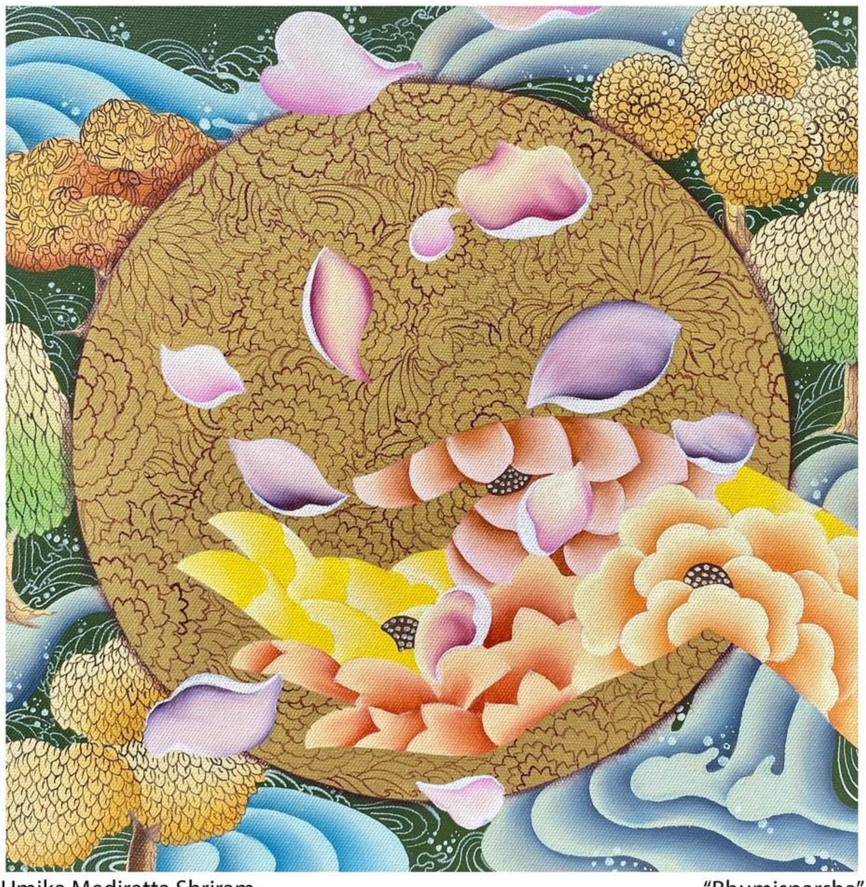
Umika Mediratta Shriram 2023