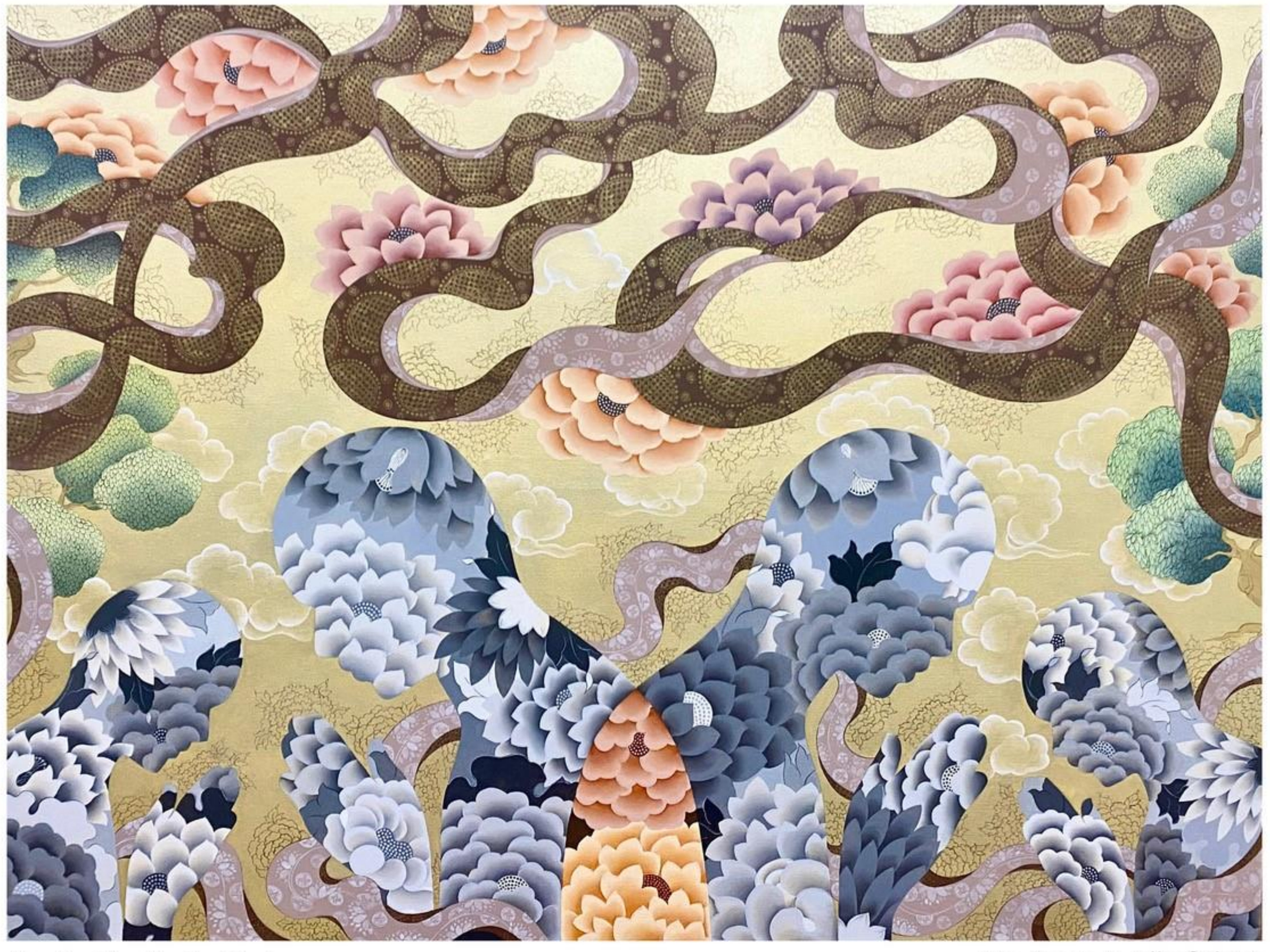
Umika Mediratta Shriram 2023