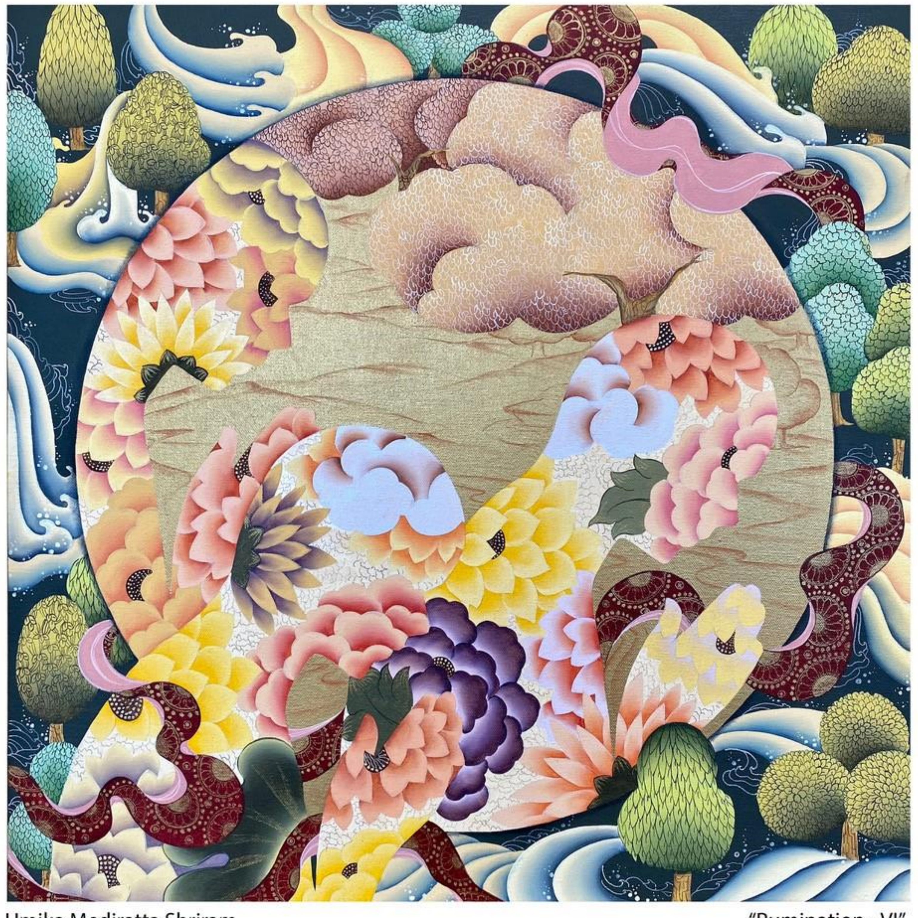
Umika Mediratta Shriram 2023