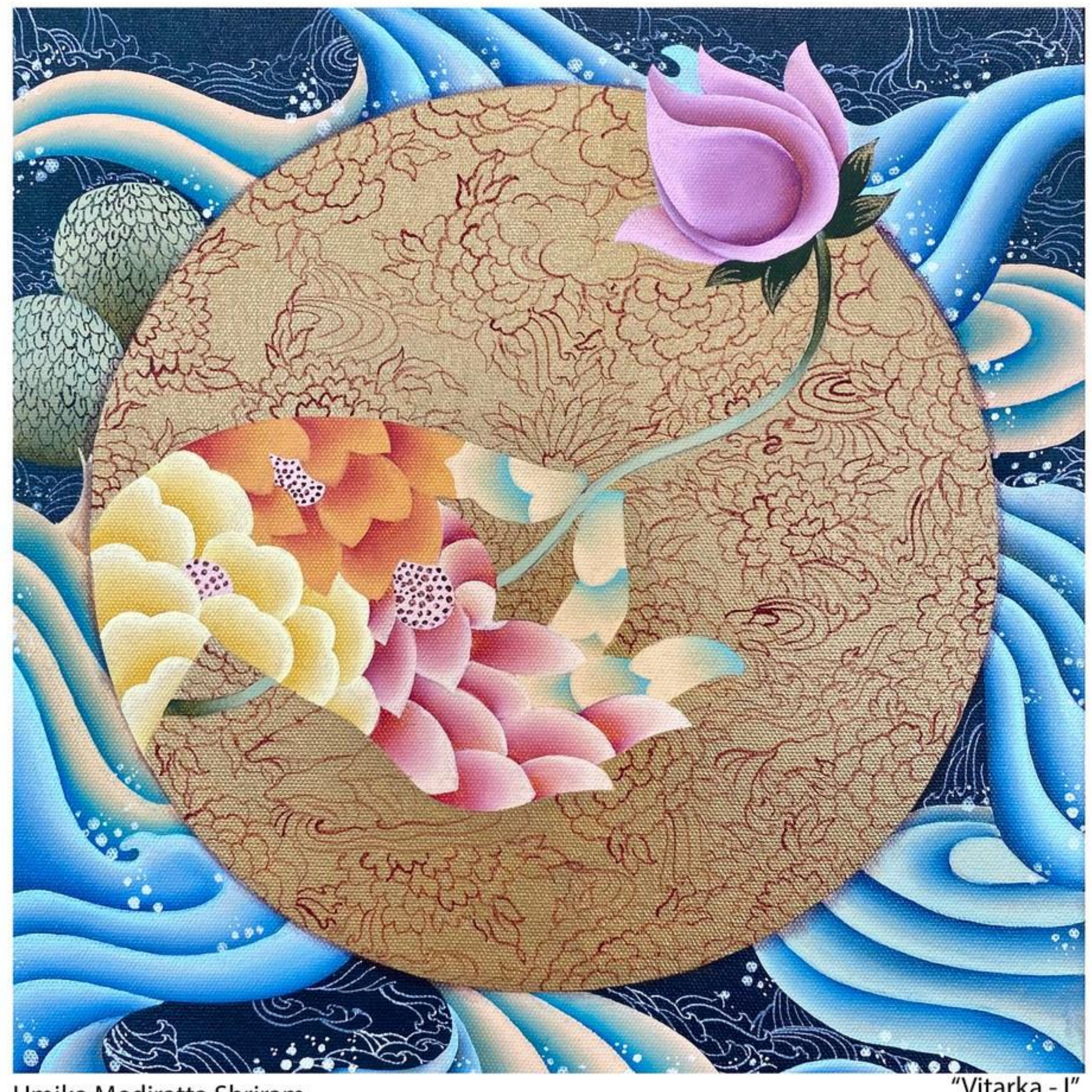
Umika Mediratta Shriram 2023