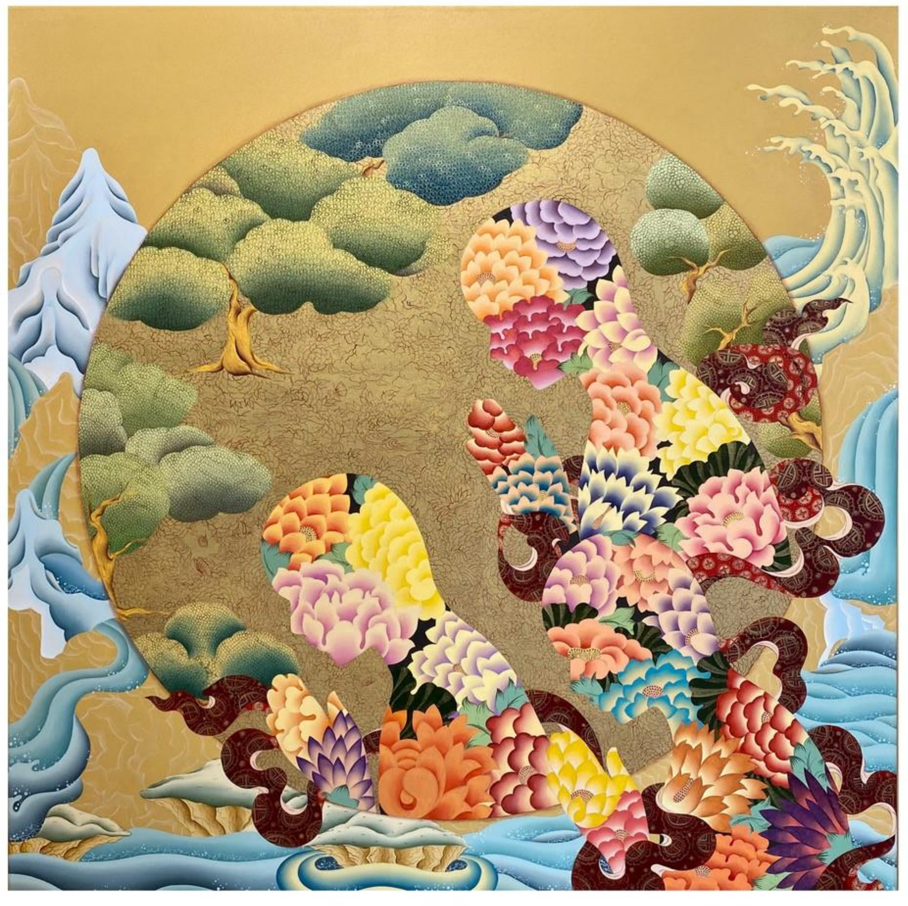
Umika Mediratta Shriram 2023