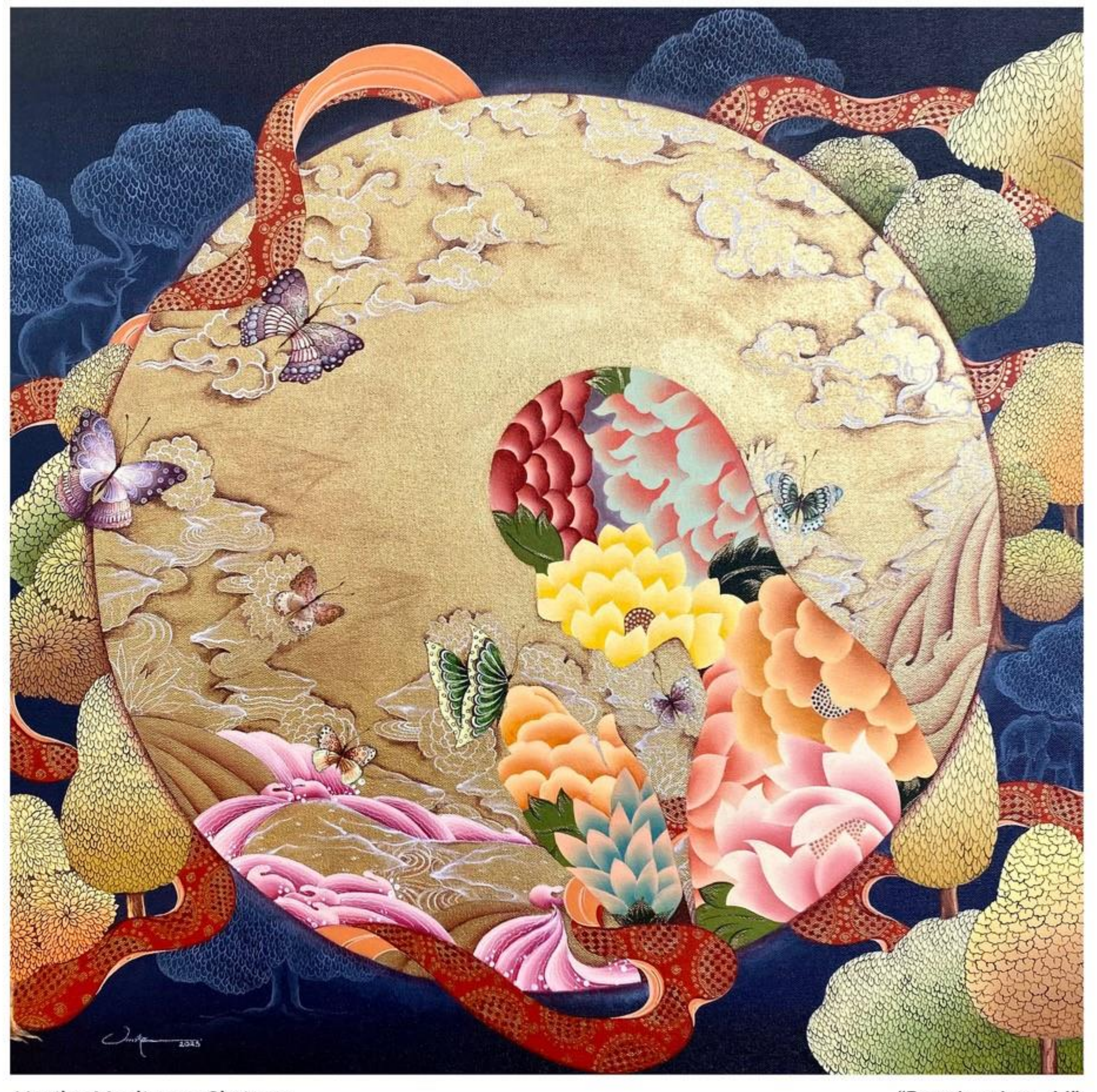
Umika Mediratta Shriram 2023